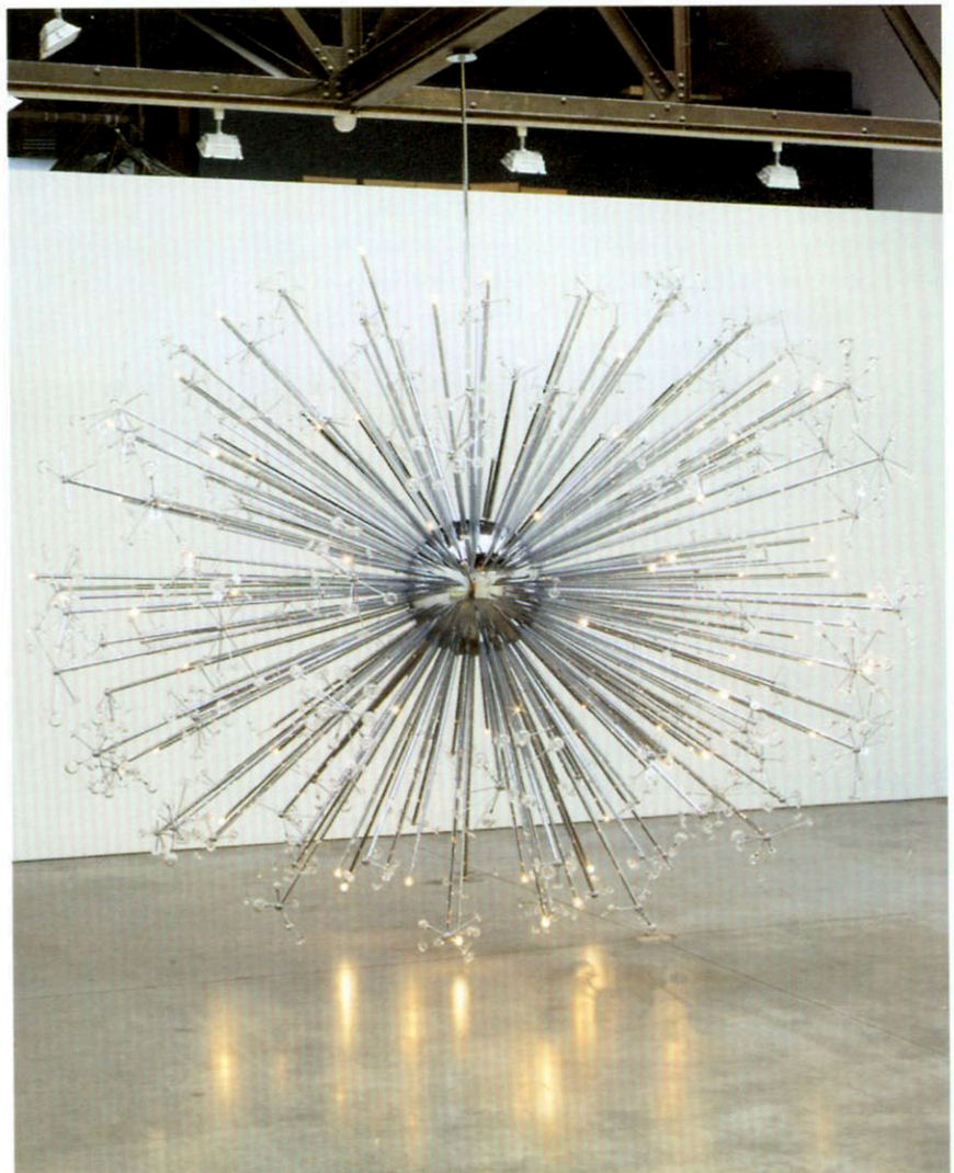
> Josiah McElheny, An End to Modernity, 2005, nickel-plated aluminium, electric lighting, hand-blown glass, steel cable, rigging.